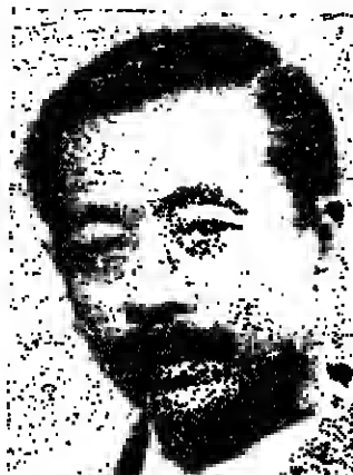
Nguyen Cao Ky

SAIGON, April 19 (Reuters).—Vice-President Nguyen Cao Ky made a bitter and sweeping attack on the South Vietnamese administration today and declared that the country should seek a political solution to the war. The vice-president mocked official claims of "victory" in Laos, denounced "a new class of war profiteers" and declared that "the people have lost all faith in the government." He compared South Vietnam to a sinking ship and said it was too late to talk about a military solution to the war. Speaking at a seminar at the Saigon School of Social Welfare and talking informally to Vietnamese reporters afterward, the vice-president gave the strongest expression so far to his dramatically changed position over the last few months. Long an outspoken hawk, the former air vice-marshal was the most powerful man in the Saigon government as premier under the pre-1967 constitution. But after accepting second place to President Nguyen Van Thieu four years ago, he was